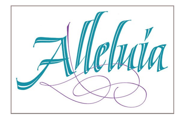
As the Father loves me, so I also love you. Remain in my love.