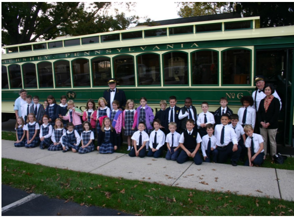
2nd grade students on a trolley ride after learned about Mr. Milton Hershey.