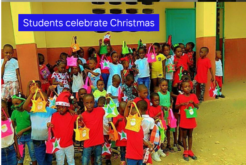
Students celebrate Christmas