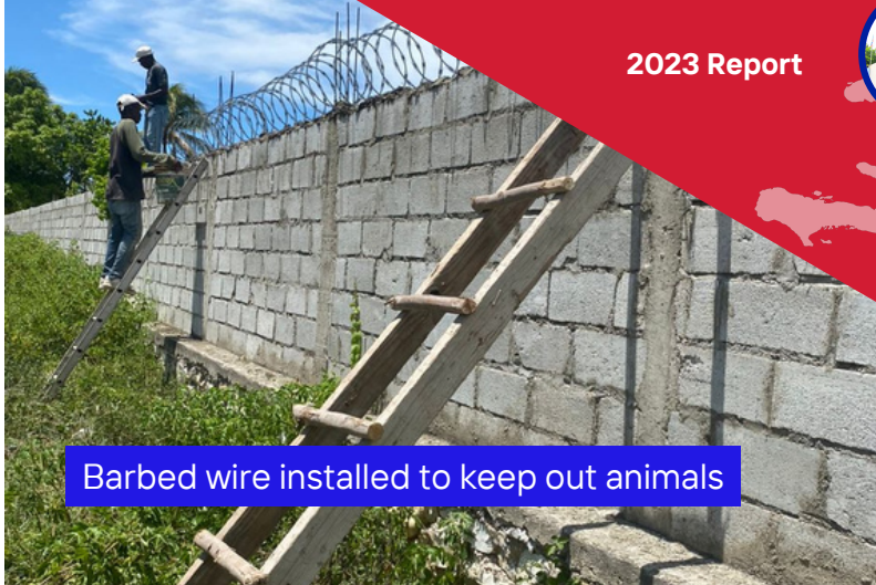
Barbed wire installed to keep out animals