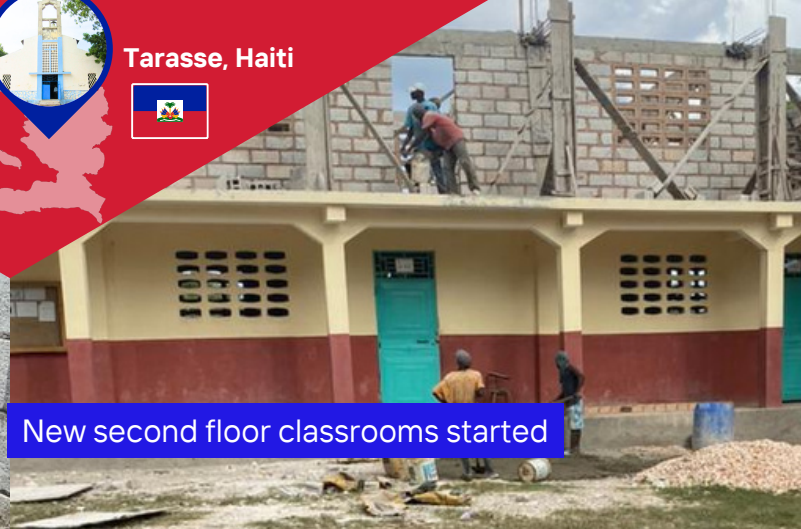
New second floor classrooms started