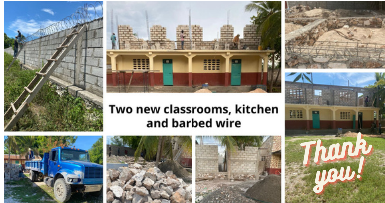
Two new classrooms, kitchen and barbed wire