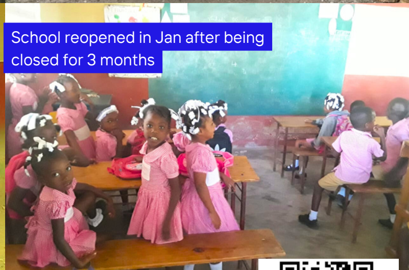
School reopened in Jan after being closed for 3 months