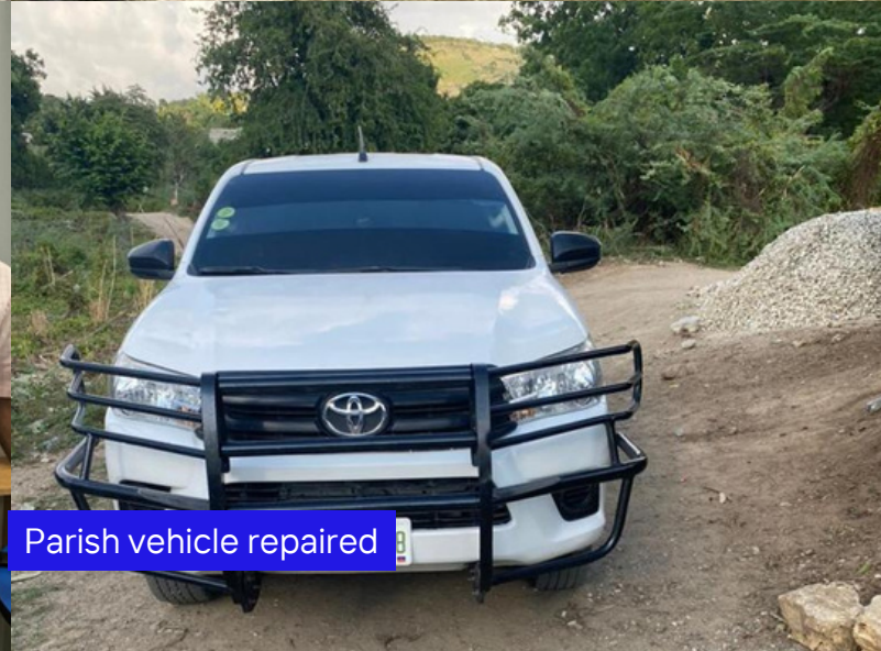
Parish vehicle repaired