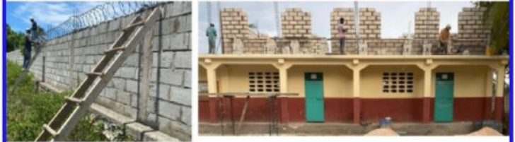
Our Lady of Lourdes Parish & Sainte Jeanne d'Arc School

In 2023, your contributions were used to repair the parish vehicle, install barbed wire on the enclosure, provide Christmas gifts for the students and make progress on the construction of the rectory, 2 new classrooms and a new school kitchen.