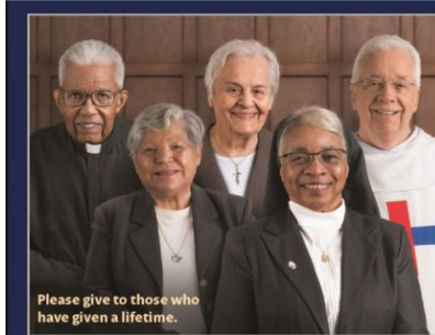
Retirement Fund for Religious

Please donate to help thousands of elderly religious individuals retire with dignity. Your donation will provide essential care, medicine and other necessities for nearly 25,000 senior sisters, brothers and religious order priests who have served for decades-