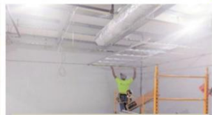
Ceiling Grid in 8th Grade Classroom