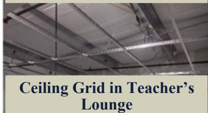
Ceiling Grid in Teacher's Lounge