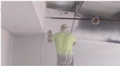
Primer and 1st Coat of Paint Applied