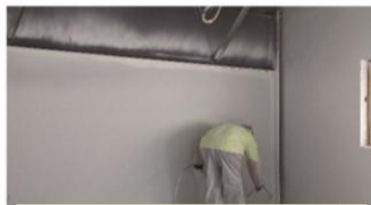
Spray Paint 8th Grade Classroom