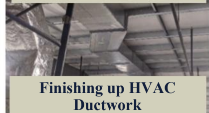
Finishing up HVAC Ductwork