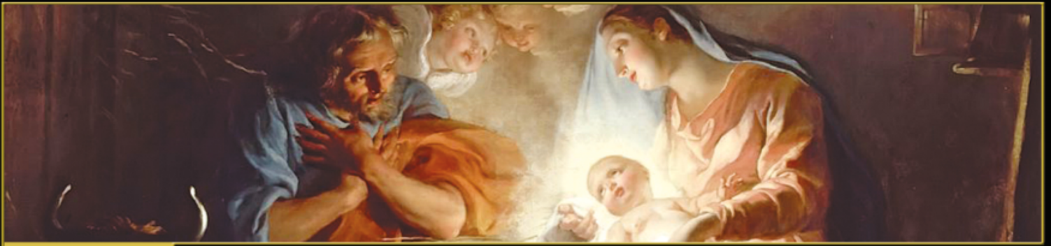
© Diocesan / The Athenaeum - Nativity (1730) - Noel-Nicolas Coypell III