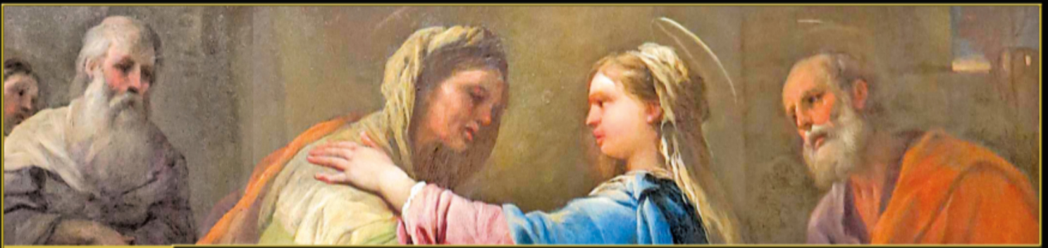
The Visitation (1696) - Luca Giordano