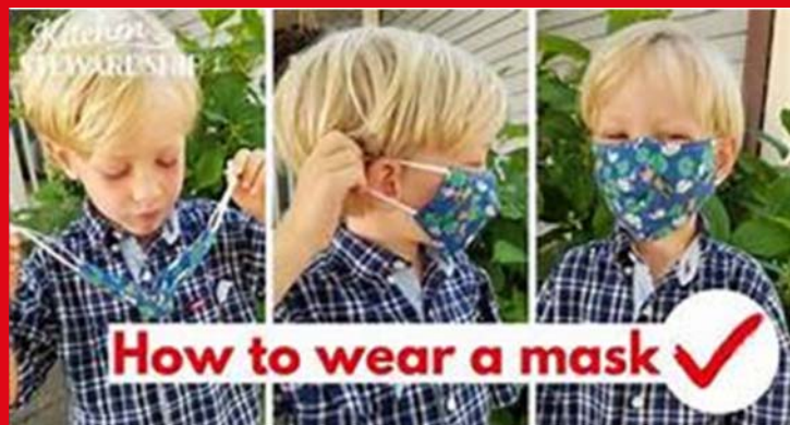
How to wear a mask ✓

HELP US KEEP OUR PARISHIONERS SAFE AND HEALTHY!