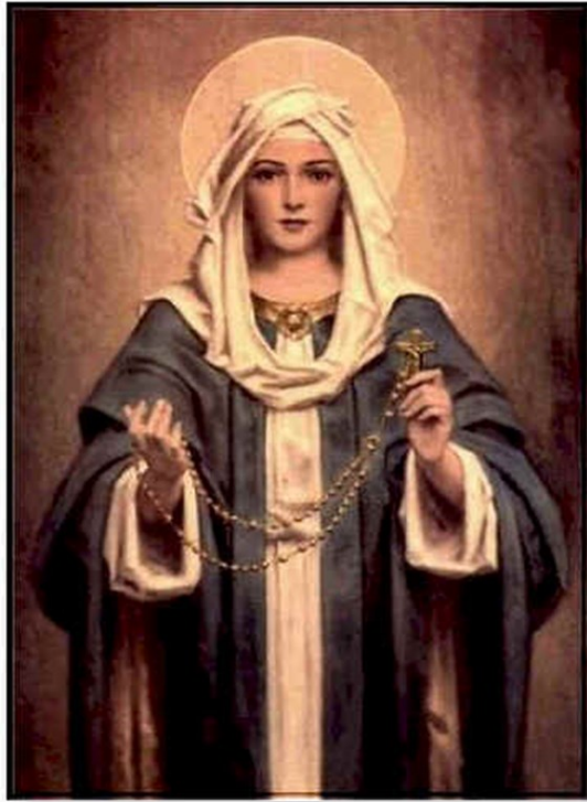
OUR LADY OF THE ROSARY, PRAY FOR US AS WE PRAY TO YOU!

Pray the rosary daily. Bring your needs to our Heavenly Mother and believe with all your heart that she will present them to her Son! Pray the most ancient prayer to Our Lady: