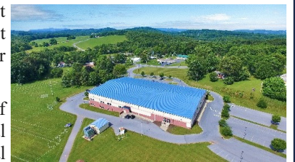
Lancaster Mennonite School, Hershey Campus