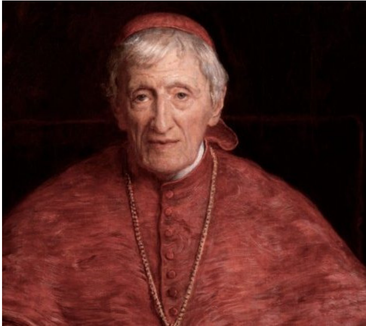
Saint John Henry Newman, Canonized on October 13, 2019