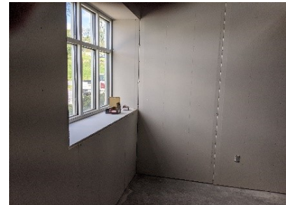
Admin offices drywall

For more information on how you can help, please visit www.stjoanhershey.org/TheCentennialProject