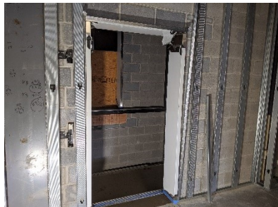
Elevator door frame blocked in