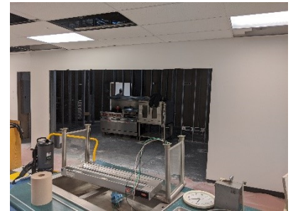
Kitchen opened to serving area