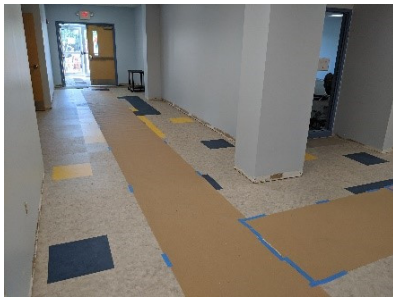
Tile complete in the hallway

None of this can be accomplished without your generous support. Your gift is an investment in the future of our children. It will also allow beautiful improvements to the Social Hall & Kitchen at our Areba location. Please visit our website and learn how you can help. Thank you!