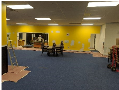
Cafeteria wall paint prep & tape