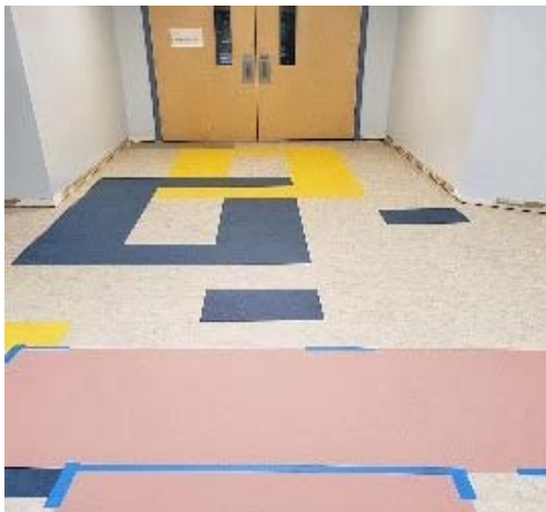
New Tile & Paint