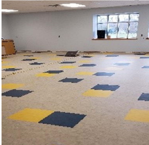
New Tile & Paint