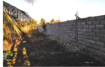
RECTORY - IN PROGRESS